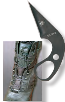
Last Ditch Knife Hard Plastic Sheath

Blade Length: 1.75" Blade Width: 0.78" Overall Length: 3.625" Sheath: 1478S