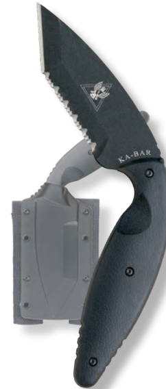
Large TDI Tanto Serrated Hard Plastic Sheath with Nylon Webbing Straps (MC)

Blade Length: 3.688" Blade Width: 1.25" Overall Length: 7.75" Sheath: 1482S