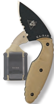
Original TDI Half-Serrated Hard Plastic Sheath with Belt Clip

Blade Length: 2.313" Blade Width: 1.25" Overall Length: 5.625" Sheath: 1477S-Hard Plastic