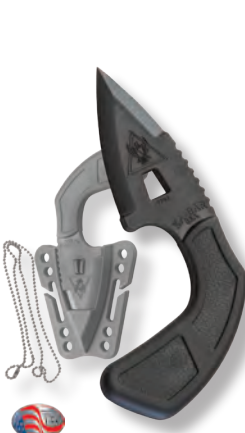
TDI Shark Bite Hard Plastic Sheath

* Clam Pack available for these items. Simply place a "CP" following the item number when ordering. Sheaths denoted with (MC) are MOLLE compatible.