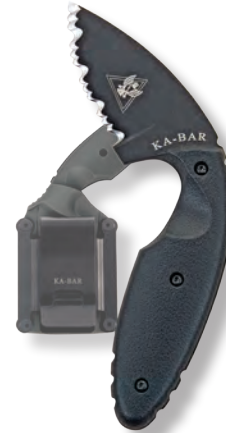
Original TDI Serrated Hard Plastic Sheath with Belt Clip

Blade Length: 2.313" Blade Width: 1.25" Overall Length: 5.625" Sheath: 1480S