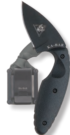
Original TDI Hard Plastic Sheath with Belt Clip

Blade Length: 2.313" Blade Width: 1.25" Overall Length: 5.625" Sheath: 1480S