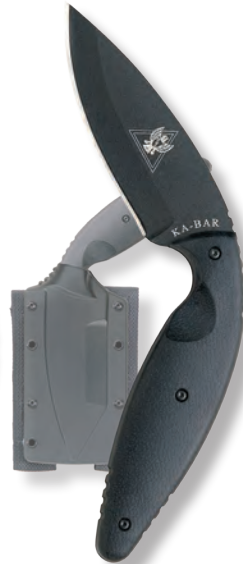
Large TDI Hard Plastic Sheath with Nylon Webbing Straps (MC)

Blade Length: 3.688" Blade Width: 1.25" Overall Length: 7.75" Sheath: 1482S