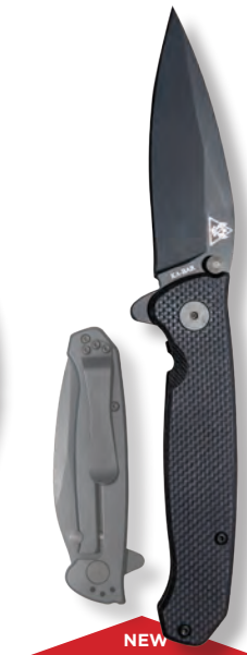
TDI Flipper Folder

Blade Length: 3.5" Blade Width: 1.0625" Overall Length: 8.25"