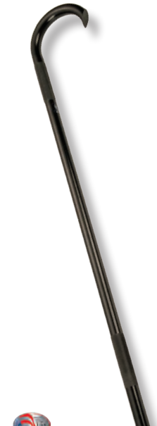
TDI Self-Defense Cane

Overall Length: 39" Weight: 2.15 lb Wall Thickness: 0.125"