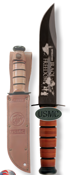
Operation Iraqi Freedom USMC Leather Sheath

Blade Length: 7" Blade Width: 1.188" Overall Length: 11.875" Sheath: 1217S-USMC