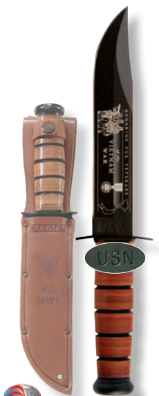
Vietnam USN Leather Sheath

Blade Length: 7" Blade Width: 1.188" Overall Length: 11.875" Sheath: 1225S-USN