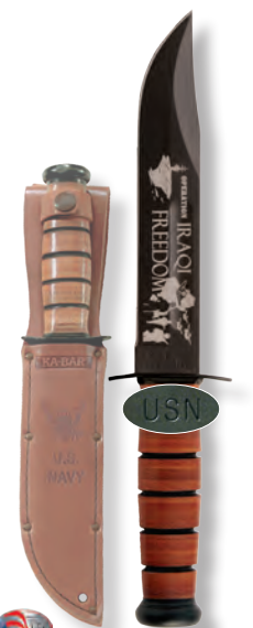
Operation Iraqi Freedom USN Leather Sheath

Blade Length: 7" Blade Width: 1.188" Overall Length: 11.875" Sheath: 1225S-USN