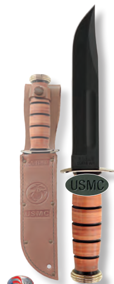
Presentation Grade USMC Leather Sheath

Blade Length: 7" Blade Width: 1.188" Overall Length: 11.875" Sheath: 1217S-USMC