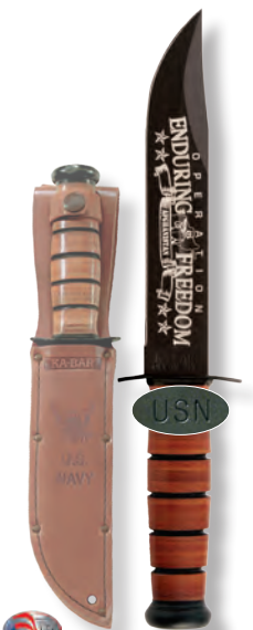
OEF Afghanistan USN Leather Sheath

Blade Length: 7" Blade Width: 1.188" Overall Length: 11.875" Sheath: 1225S-USN