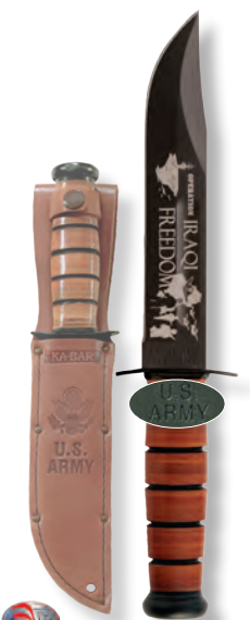
Operation Iraqi Freedom U.S. ARMY Leather Sheath

Blade Length: 7" Blade Width: 1.188" Overall Length: 11.875" Sheath: 1220S-U.S. ARMY