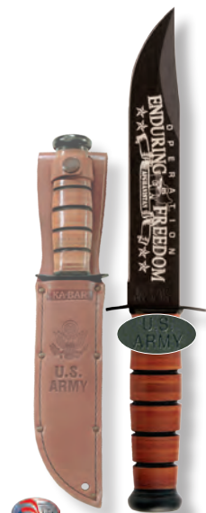
OEF Afghanistan U.S. ARMY Leather Sheath

Blade Length: 7" Blade Width: 1.188" Overall Length: 11.875" Sheath: 1220S-U.S. ARMY