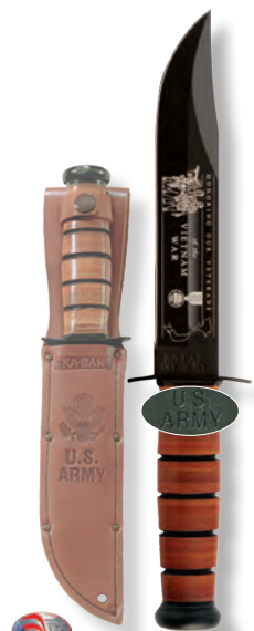
Vietnam U.S. ARMY Leather Sheath

Blade Length: 7" Blade Width: 1.188" Overall Length: 11.875" Sheath: 1220S-U.S. ARMY