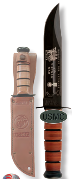
Vietnam USMC Leather Sheath

Blade Length: 7" Blade Width: 1.188" Overall Length: 11.875" Sheath: 1217S-USMC