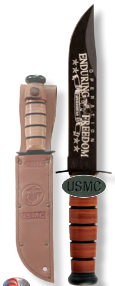
OEF Afghanistan USMC Leather Sheath

Blade Length: 7" Blade Width: 1.188" Overall Length: 11.875" Sheath: 1217S-USMC